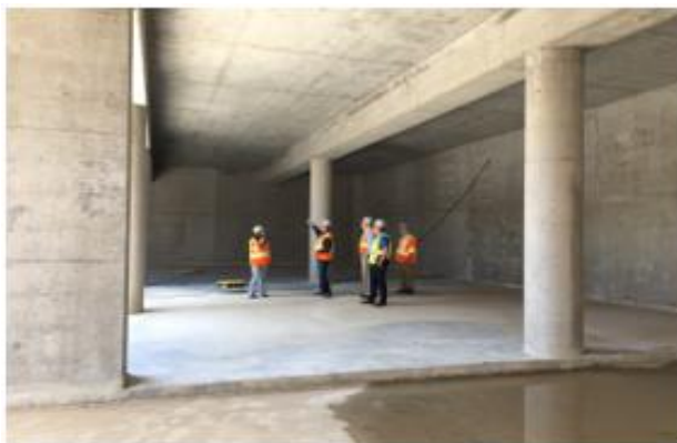
Tene and Texzon Reps at the Texzon Launch Site in Waxahatchie, TX