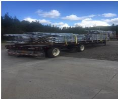
Framing and Trusses produced by Tog Manufacturing equipment for the White Mountain Project

Our light gauge steel framing and trussing equipment is now up and operational. It was used to produce the framing and trusses for the White Mountain and Noorvik Projects. Our folks are now building sip panel walls onsite with closed cell foam technologies at the White Mountain and Noorvik job sites. Our goal is to grow this subsidiary into a year-round high production operation producing framing trussing and sip panel walls for commercial and government clients. We have several stock plans online that can be viewed at www.togcorp.net .