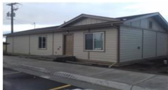
Idaho Bunkhouse Near completion!