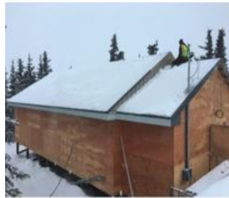
Noorvik Project, nearing completion.

We are building the home for the Baldwin family in