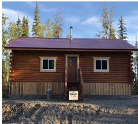
Cabin built in Nenana from the ground up in coordination with the Nenana Native Council to be sold to IRHA.

of cut and split firewood sells for $250 (with free delivery within ten miles of Nenana). A truckload of firewood (about 10 cords) sells for $1,000 (with free delivery from Healy to Fairbanks). Toghotthele shareholders receive a 10% discount off this price. Tog Timbers, LLC also completed a cabin in conjunction with the Nenana Native Council that IRHA is purchasing for $150,000.