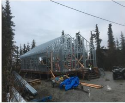
Noorvik Baldwin House 10/7/2017

Kwethluk Electrical – $135,000-dollar Electrical project. Toghotthele secured and performed the Electrical work on a store in Kwethluk, AK. We performed and were paid for $95,000.00 dollars’ worth of work and are anticipating going back to complete the rest of the project in the coming months